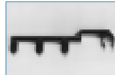
Film clip RiXmatic one/two for all miniature formats